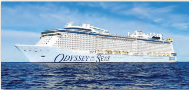
Complete deck plans can be viewed online at www.templetonours.com

Capacity: 3,844 passengers Crew: 1,305 Tonnage: 169,300 gross tons Length: 1,142 ft Beam: 161 ft Decks: 16 Speed: 22 knots Year Built: 2020 Specialty Restaurants: 5 + Starbucks