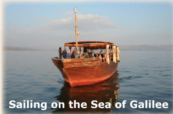
Sailing on the Sea of Galilee

After breakfast we take a boat ride across the Sea of Galilee. While on the boat we'll pause for a brief worship service and remember the many miracles our Lord performed in this area. We'll dock at Nof Ginossar to