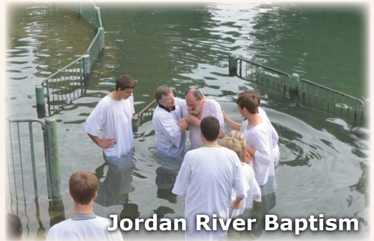
Jordan River Baptism

visit the "Jesus Boat" museum to see a boat that dates back to the time of Jesus. Then we will drive to the site of Caesarea Philippi (Baniyas) where springs form a source of the Jordan River. Near here Peter made his great confession that Jesus Christ is Lord! From several vantage points today we can see Mount Hermon in the distance. As we make our way around the Eastern side of the Sea of Galilee, we will travel through the Golan Heights where our guide will explain the controversial and strategic points of this important tract of land. After lunch we will stop at the Primacy of Peter where Jesus commanded Peter to "Feed my sheep." Next, we