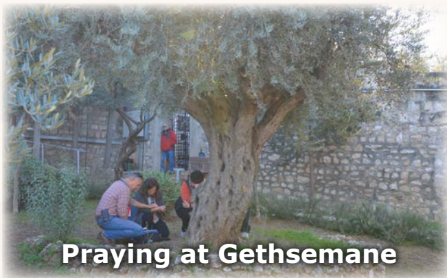
Praying at Gethsemane

This morning we will begin our tour with a visit to the Temple Mount where the Jewish temple stood until its destruction by the Roman Legions in 70 A.D. There we will see the Dome of the Rock Mosque built over the rock where Abraham prepared to sacrifice Isaac, the Al-Aqsa Mosque, and the Golden Gate. We'll continue our walk through the Old City to the beautiful Crusader Church dedicated to St. Anne and the nearby Pool of Bethesda. Then we travel a short distance to the Mount of Olives for a breathtaking view of the city of Jerusalem. While we are here, our guide will point out all of the important sites of Jerusalem. We will proceed to Mount Zion to visit the Upper Room, traditional site of the Last Supper and the fire of the Holy Spirit on Pentecost. We will then head to the Southern Wall excavation site. Here we will walk on the very stones where Jesus trod