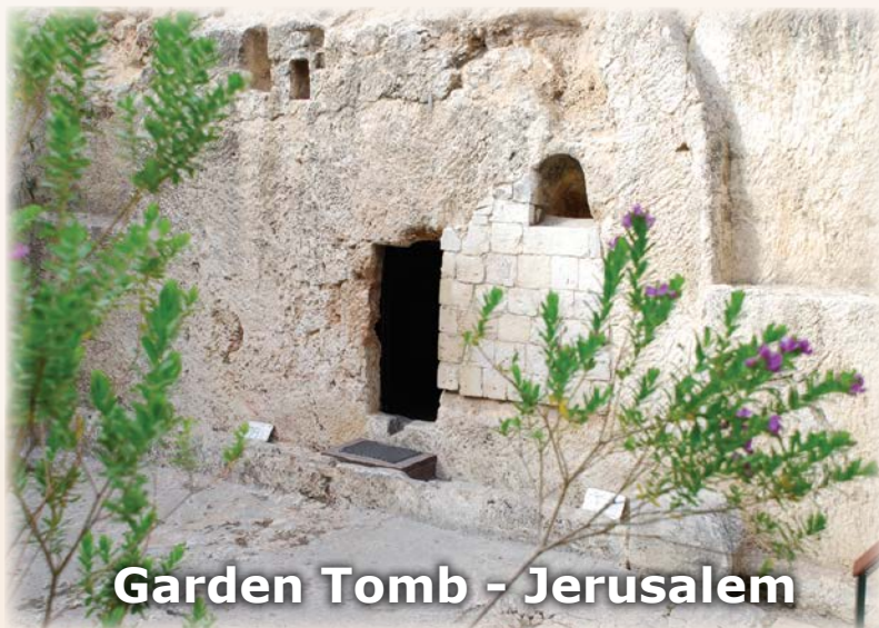
Garden Tomb - Jerusalem

Today our memorable journey and Holy Land pilgrimage comes to an end. We will transfer to the airport in Tel Aviv and board the plane for our return flight home. In flight we can fellowship with our friends and remember the many things we shared together.