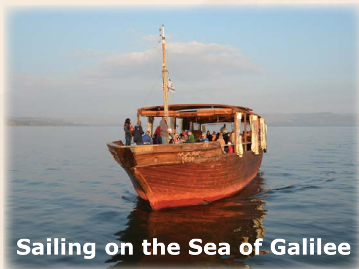
Sailing on the Sea of Galilee

After breakfast, we will depart Tel Aviv and travel up the coast to Caesarea by the Sea. There we will visit the Crusaders' castle, the Roman amphitheater, the seaport from which the Apostle Paul sailed to Rome, and the Roman aqueduct system. We continue along the coast to Mount Carmel to see the site of Elijah's triumph over the prophets of Baal. After lunch we will travel to Nazareth, the boyhood home of Jesus, to visit the oldest of the churches of the annunciation and Mary's well. Here we will also visit The Precipice, where they wanted to throw Jesus off the "brow" and kill Him. The Precipice also gives a great view of the "Valley of Armageddon." On our way to Tiberias we will stop in the little town of Cana where Christ turned the water into wine. We will hold a short ceremony in an ancient church for the couples who wish to renew their marriage vows. Then we'll proceed to our hotel in Tiberias on the Sea of Galilee for dinner and overnight. (B/L/D)