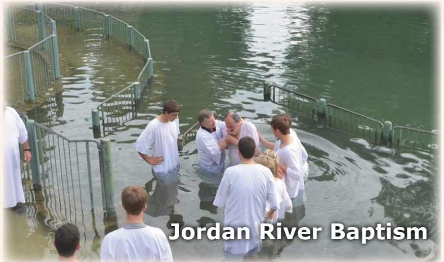
Jordan River Baptism

After breakfast we take a boat ride across the Sea of Galilee. While on the boat we'll pause for a brief worship service and remember the many miracles our Lord performed in this area. We'll dock at Nof Ginossar to visit the "Jesus Boat" museum to see a boat that dates back to the time of Jesus. Then we will stop at the Primacy of Peter where Jesus commanded Peter to "Feed my sheep." We'll proceed to Capernaum