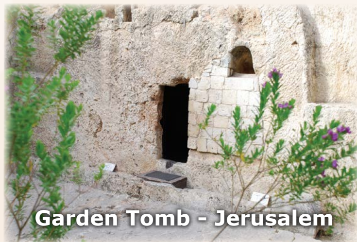
Garden Tomb - Jerusalem

Today our memorable journey and Holy Land pilgrimage comes to an end. We will transfer to the airport in Tel Aviv and board the plane for our return flight home. In flight we can fellowship with our friends and remember the many things we shared together.