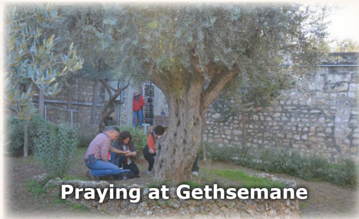
Praying at Gethsemane

This morning, conditions permitting, we will begin our tour with a visit to the Temple Mount where the Jewish temple stood until its destruction by the Roman Legions in 70 A.D. There we will see the Dome of the Rock Mosque built over the rock where Abraham prepared to sacrifice Isaac, the Al-Aqsa Mosque, and the Golden Gate. We'll continue our walk through the Old City to the beautiful Crusader Church dedicated to St. Anne and the nearby Pool of Bethesda. Then we travel a short distance to the Mount of Olives for a breathtaking view of the city of Jerusalem. While we are here, our guide will point out all of the important sites of Jerusalem. We will proceed to Mount Zion to visit the Upper Room, traditional site of the Last Supper and the fire of the Holy Spirit on Pentecost. We will then head to the Southern Wall excavation site. Here we